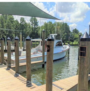
The Last Plank campaign, plaques still available for purchase.

WE NEED YOUR HELP! Ker Place is looking for docents and volunteers. If you are interested please give us a call at (757) 787-8012.