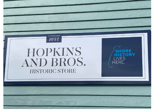
ABOVE: In 2022, Shore History unveiled its new branding and signage.

or of Hopkins store and ticket office provided us the perfect backdrop for the unveiling of the new look to the general public. Pictures here show the transformation.