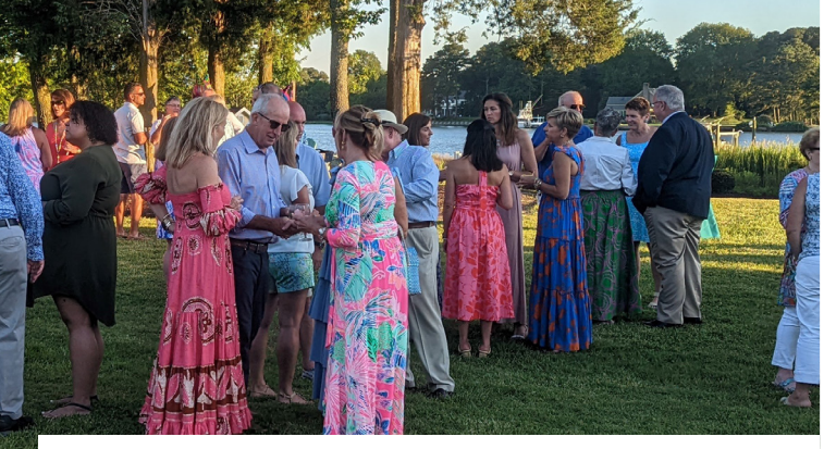
After 3 years, the Annual Gala was held at Kingsfield on the Creek.