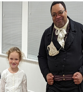
Nation Builders-James Armistead Lafayette