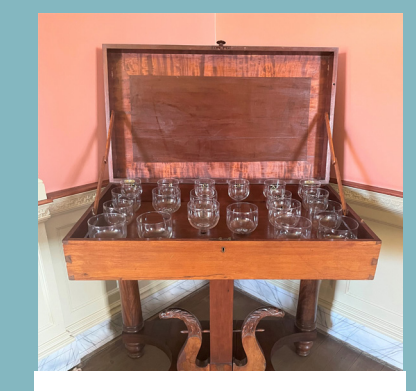
ABOVE: L1.20222 Grand Harmonicon in Ker Place.