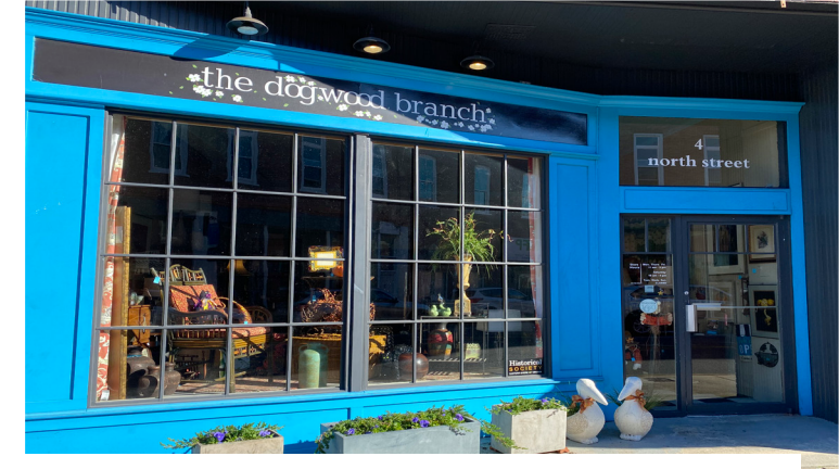
The Dogwood Branch, a fundraising intiative for Shore History.