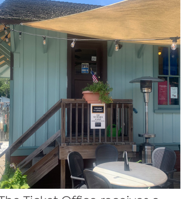
The Ticket Office receives a fresh coat of paint.